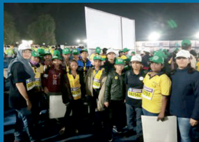
Marathon - Run for a Cause