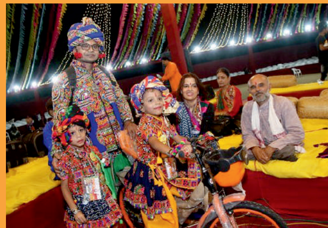
BCC Bal Garba Mahotsav